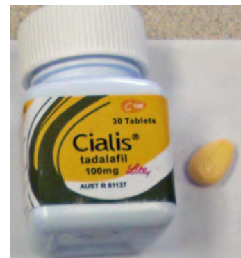
Counterfeit pharmaceuticals are packaged and presented in a convincing manner. The above shows both the container as well as the individual pill analyzed below

Recent advancements in the field of X-ray Diffraction now make it possible to easily perform a rapid identification and quantification of counterfeit pharmaceutical materials. As with most pharmaceutical materials, a unique x-ray diffraction pattern is presented for the active ingredient. Thus, a counterfeit material is easily and readily identified by not on the lack of the active ingredient x-ray diffraction pattern, but also the identification of the substitute material.